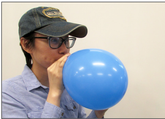
1. Inflate the balloon