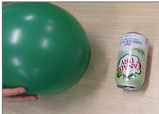
3. Lay the can on its side on a flat surface. Slowly bring the balloon close to the can, without touching it, until you see the can start to stir. Now you can guide the can to move around in any direction by moving the balloon.

Frankenstein200 puts players in the middle of the action in a story where Mary Shelley's classic tale collides with modern science. Learn more, and see more hands-on activities like this one at WWW.FRANKENSTEIN200.ORG